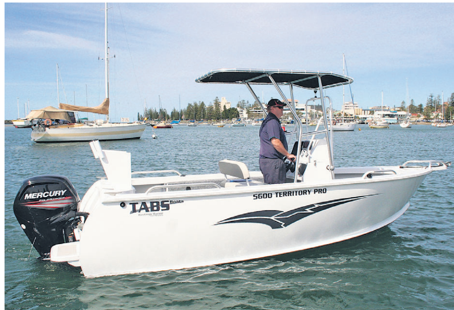
With its clean lines, the Tabs 5600 Territory Pro certainly grabs the serious fisho’s attention.

Underway, there are plenty of places to hold onto to deal with the conditions. Vision while driving seated was good and provided clear sight whether cruising along an estuary or under power