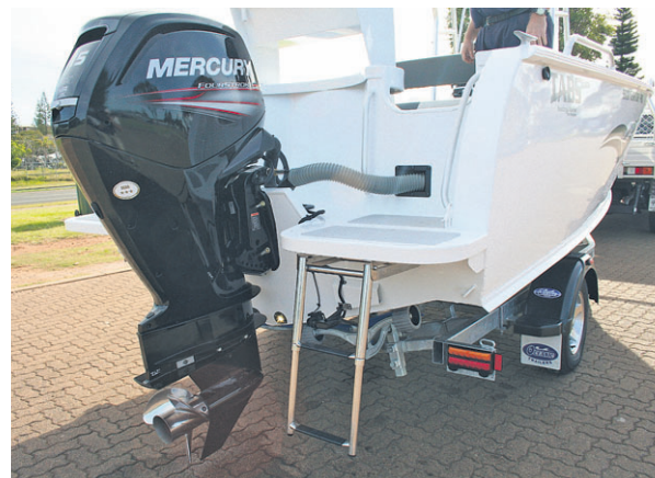
Powered by the new Mercury 115 Command Thrust 4-stroke, this boat has plenty of power.

at sea. While standing when crossing a bar and moving in big seas the Territory Pro handled well, was very stable and with seat and console rails you certainly felt safe.