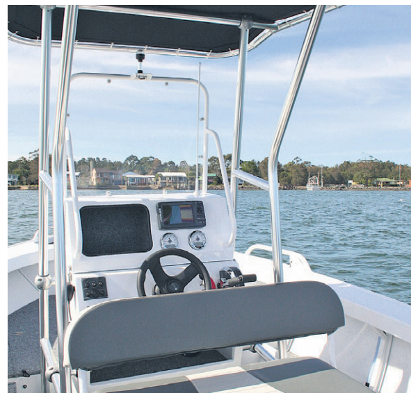
Top: The front deck has great storage, with a removable 90L icebox for keeping the catch fresh. Middle: The plate hull design contributes to the Territory Pro’s great handling characteristics. Bottom: The flip-flop backrest makes for a great driving position, or a comfortable spot to lean back and watch the rods when fishing.