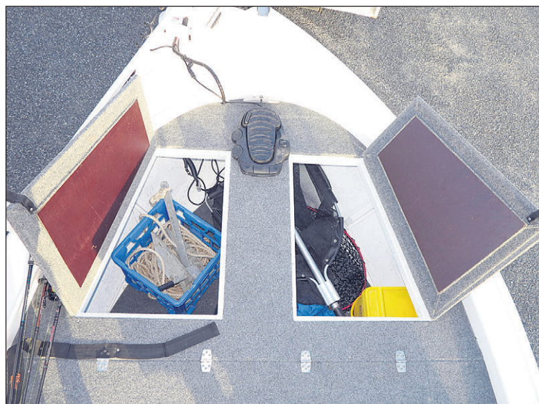
Two hatches towards the bow provide plenty of room for storage.