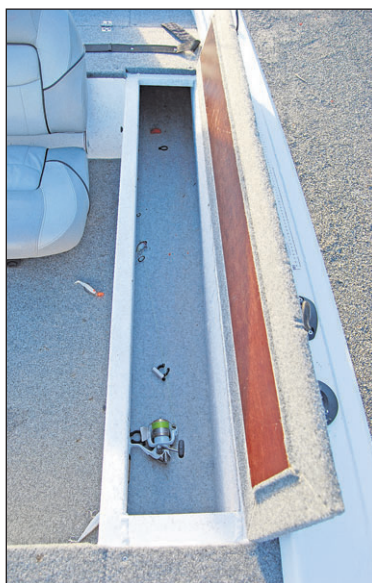
Check out the roomy rod locker.

For more information contact the Tabs team via email at sales@tabs-boats.com.au or call 07 5594 6333.